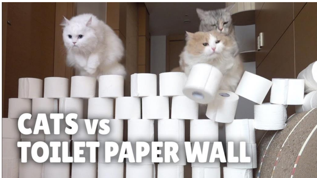
Cats vs Toilet Paper Wall - Kittisaurus